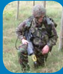
Narrow band body worn antenna attached to webbing for convenience and reliable coverage for foot patrol