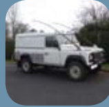
Antennas for Light Vehicles