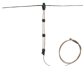
Centre frequency 350MHz