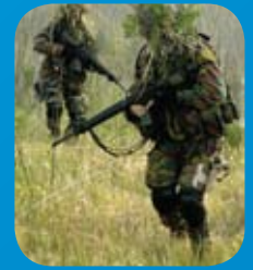
Body worn and wearable antennas for foot patrol