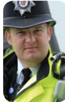
Front Line, Live Video Surveillance

A light weight, directional antenna (model DHDA-2.4V/1448) was designed for integration within the Body Worn Video Wireless Solution, developed by Reveal Media and Cobham Surveillance/Domo, providing four live video feeds and GPS data. This system was used at Glastonbury Rock Festival by Avon & Somerset Police foot patrol and mounted officers.