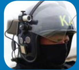
Front line, video surveillance utilising helmet mounted antennas