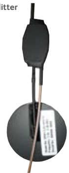
DPA1-2.3V/1610 Narrow Dual Patch Antenna 4mm thick, with splitter