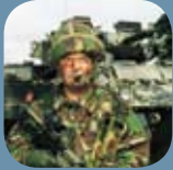
Body Worn Antennas

The most important thing we build is trust