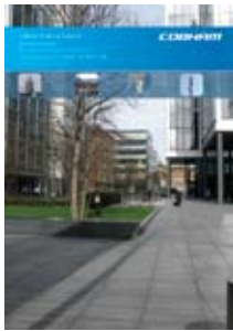
WiMAX and LTE