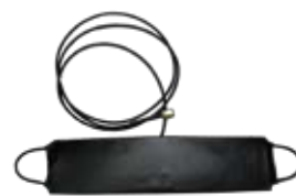
Centre frequency 380MHz