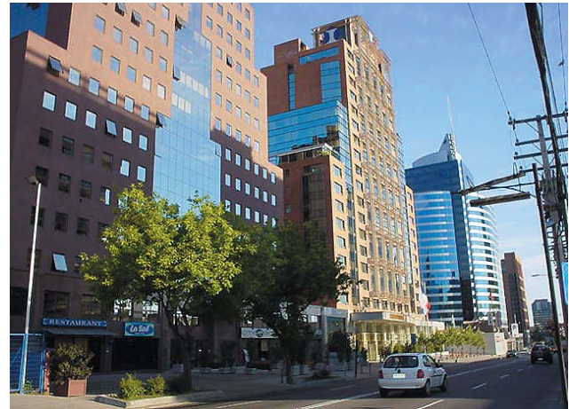
CMCA's office in Santiago, Chile

In 2003 the company established an office in Santiago, Chile through which major projects with the Chilean Government have been secured. The Chilean office also allows CMCA to test its products in some of the most extreme environments on earth.