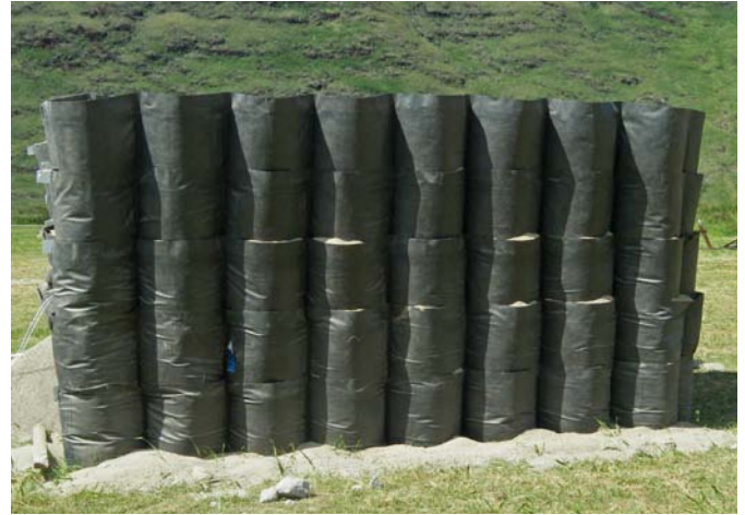
Blasthouse for 100lb bomb

The modular construction allow scalable design to meet different ordnance sizes and the proven containment means reduced stand off distances and safer disposal. The DEFENCELL material is environmentally neutral and the DEFENCELL system is perfect for operations in sensitive areas, including cultural, natural or historical sites.