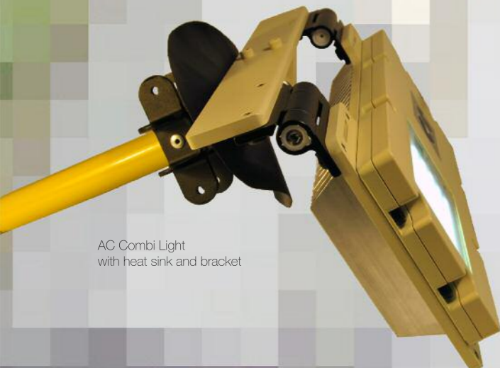
AC Combi Light with heat sink and bracket

Our dedicated engineering personnel are supported by in-house prototype, precision machining, assembly and test facilities enabling rapid turnaround of proto-type developments and urgent operational requirements. From off shelf components, to customised lighting upgrades, installation and support, we offer total solutions.