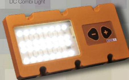
DC Combi Light