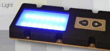
DC Combi Light