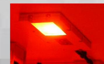
AC Combi Light in red blackout mode