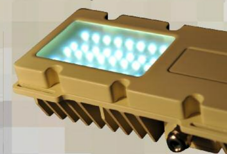
DC Combi Light with heat sink