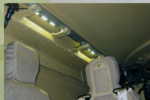
Mini floodlights installed in a military vehicle