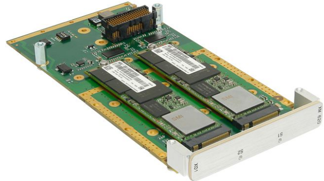
Build Option: 2 x M.2 Devices Fitted