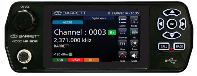
The Barrett 4075 amplifier natively supports the Barrett 4050 HF SDR Transceiver/Exciter

The 4075 linear amplifier is designed and engineered for modern communications which are heavily data orientated, requiring the equipment to work at high duty cycles for extended periods of time. The unique liquid cooled design increases efficiency resulting in less system deterioration due to overheating in the power stages,