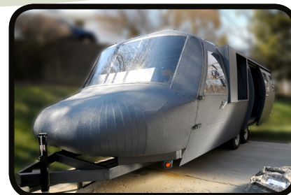
Accurate fuselage dimensions