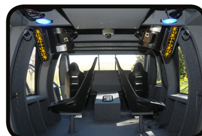
Aviation lights and fans