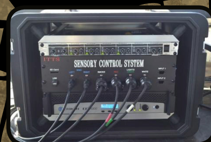
Sensory Control Unit (SCU)