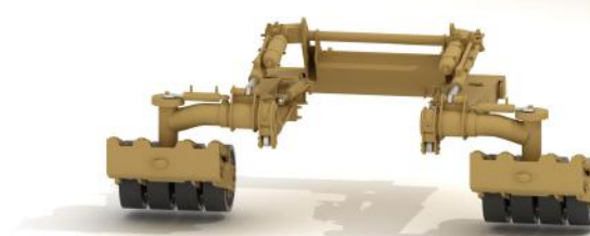
Self-Protection Combat Roller