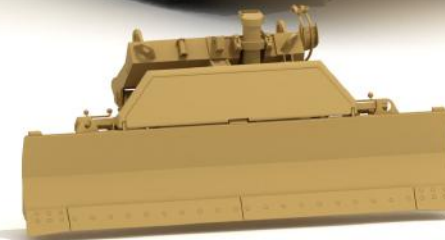
Combat Dozer Blade