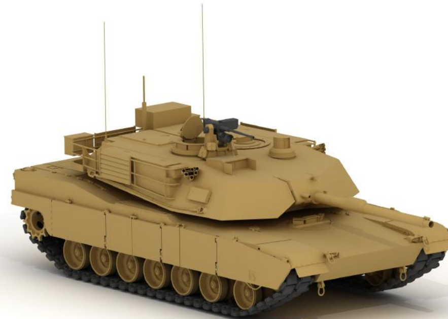
Track Width Mine Plough

Our products provide self-protection and increased mobility for Main Battle tanks when faced with a variety of obstacles.