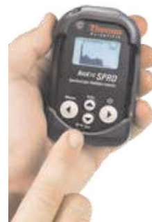
Thermo Scientific™ RadEye™ SPRD Spectroscopic Personal Radiation Detector