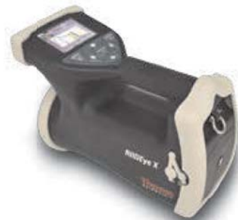
Thermo Scientific™ RIIDEye X™ Handheld Radiation Isotope Identifier