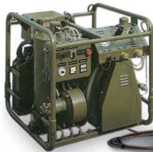
SANIJET C. 921

for multiple scenarios, whether defence or civil protection; useful when you don't know how, when or where the next CBRN crisis is going to reveal itself, whether natural or intentional.