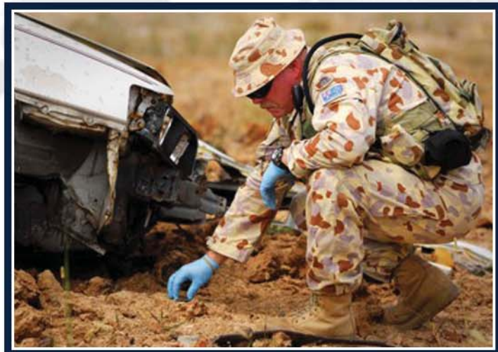
ADVANCED SEARCH & ASSESSMENT