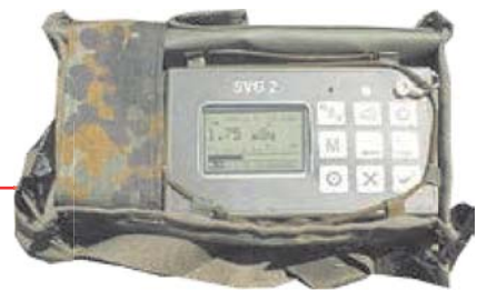
Thermo Scientific SVG 2 RadiacMeter