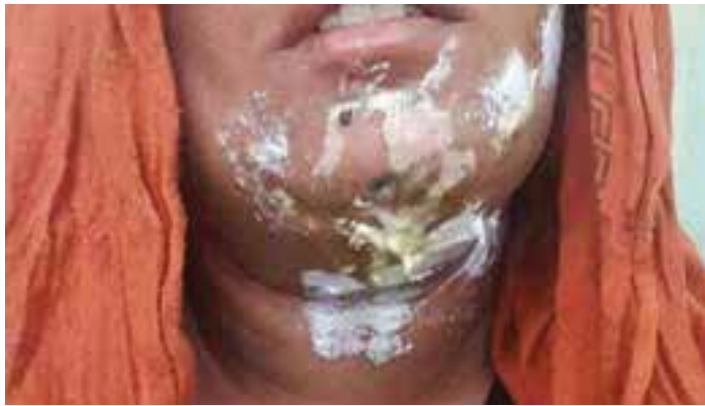
An image (above) of blisters allegedly inflicted upon a Kurdish person in Taza after a rocket attack

The indirect fire attacks against Taza, in which more than 40 rockets were reportedly launched over the period, represent a possible increase in the capability of IS to manufacture, deploy and deliver an effective mustard gas bombardment. It is unclear whether all of the rockets contained the blistering agent, however the number of casualties reported suggests a degree of dispersion. The use of rockets, as opposed to mortars, would enable IS to attack targets with a salvo effect potentially over a short duration of seconds increasing the chance of both surprise and concentration of the agent. However, reporting does not confirm this occurred at Taza.