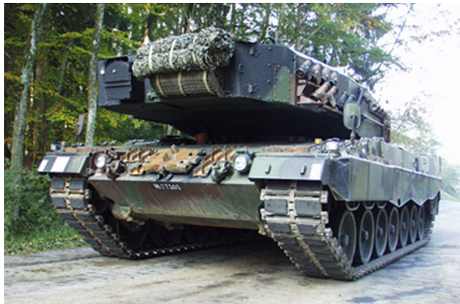
Leopard tank 55-tons