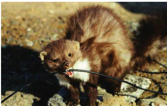
Rodents attack with bite forces of 600 N