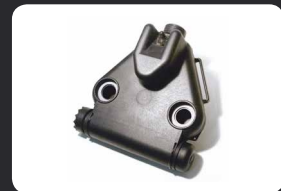
C420 PAPR BLOWER KIT