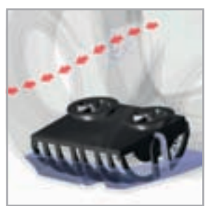
Patented secondary filter system offers highest levels of particle protection and automatically removes sweat from the mask.