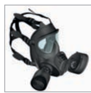
Twin filters with shut off valve enable filters to be changed without holding your breath, closing your eyes or the direct aid of a "buddy".