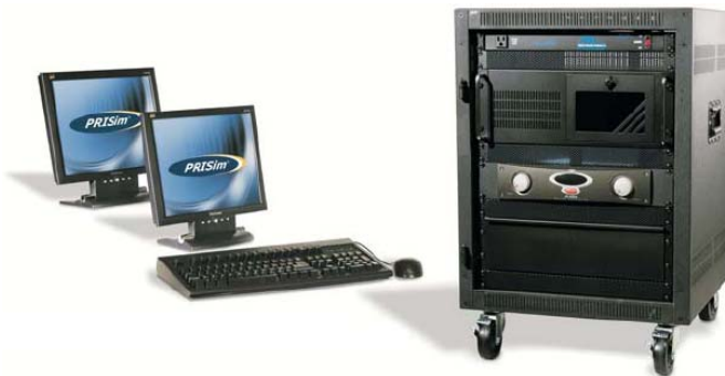
PRISim® LaserLiveTrainer PRO

PRISim Suite® LiveFire Trainer is the most technologically advanced live fire weapons simulator available on the market today. It provides a unique training environment wherein military and law enforcement professionals can combine live fire with video-based or CGI interactive scenarios for unprecedented, realistic training. PRISim Suite LiveFire Trainer is available for installation into certified live fire ranges or our self-contained modular QuickRange®.