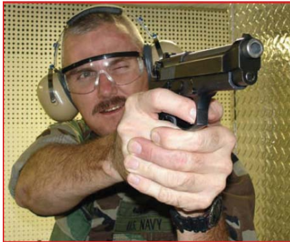
Live Fire Qualification