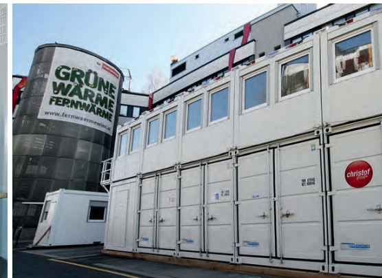
Storage and office