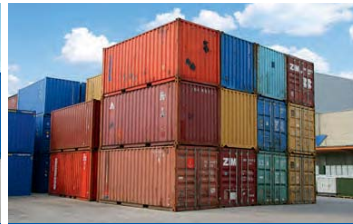
Shipping container, used