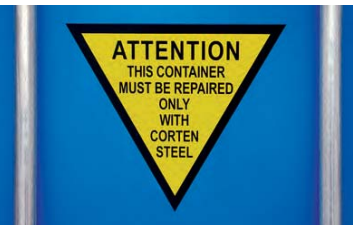
Steel plates made of Corten steel