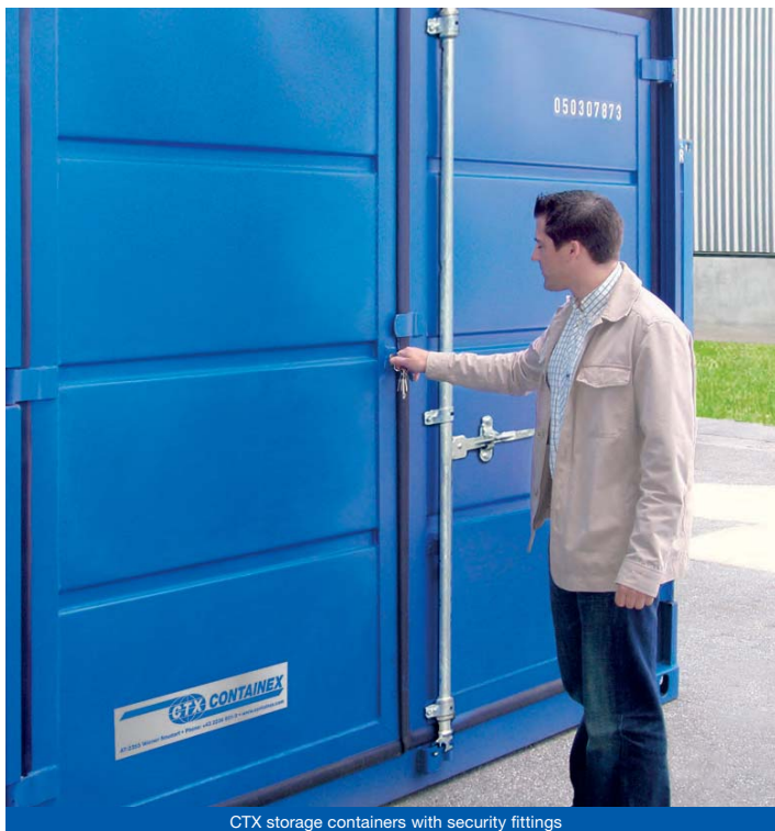
CTX storage containers with security fittings