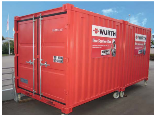
Storage container with customer branding