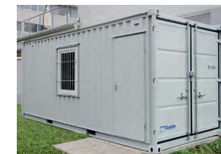
LC 20' window and entrance door

*Window and additional entrance door only available with types 10' and 20'