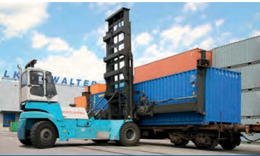
Container - rail loading