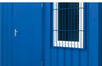
Window and entrance door*