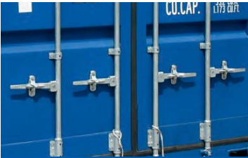
4-fold door locks