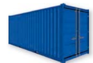
Type LC 20'