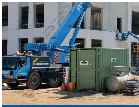
Use on the construction site