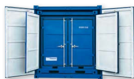
LC set example (LC 10' + 8' + 6')