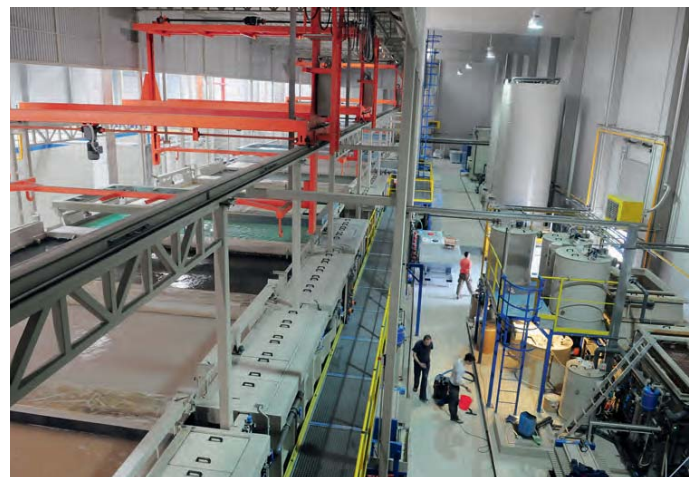
CDC coating system