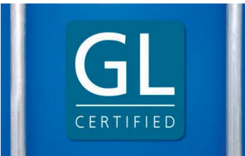
Certified by Germanischer Lloyd