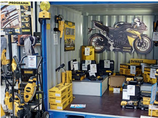
Storage container as an exhibition stand

SPACE at once CONTAINEX www.containex.com