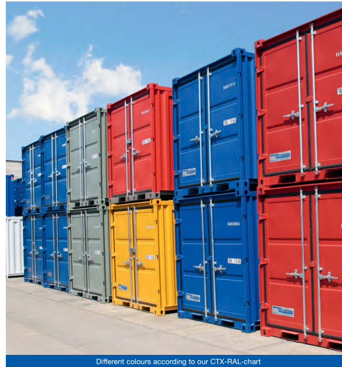
Different colours according to our CTX-RAL-chart