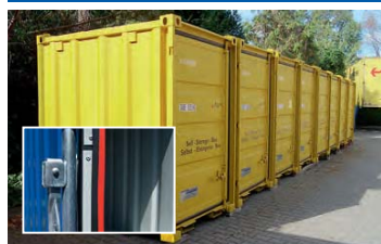
Mover box with fire protection strips