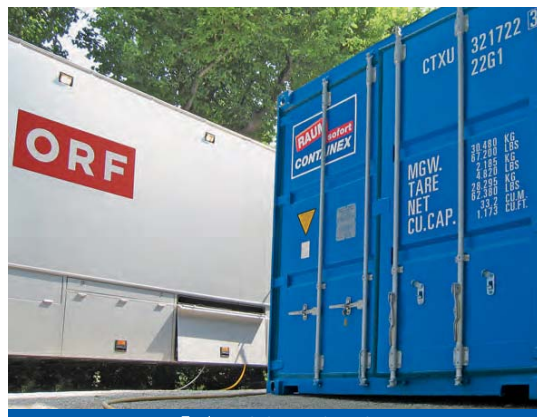
Equipment storage at events