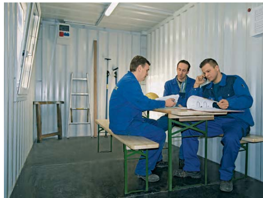
Common room on construction sites