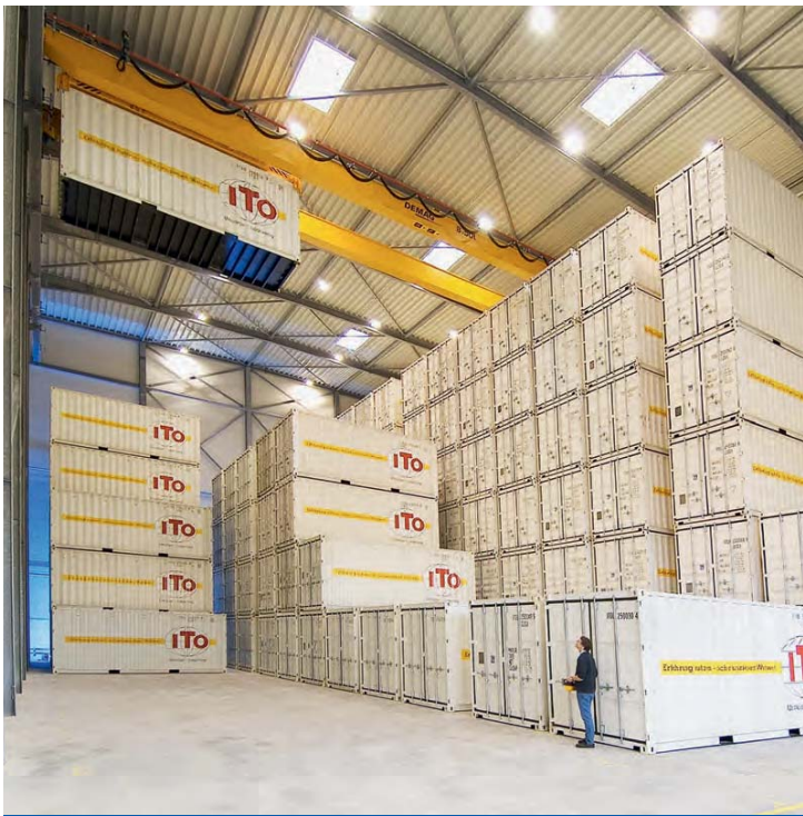
Perfect space utilization in the warehouse