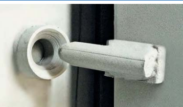
4 internal anti-jimmy devices