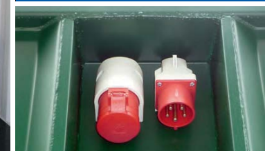
Recessed CEE connections