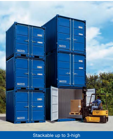
Stackable up to 3-high