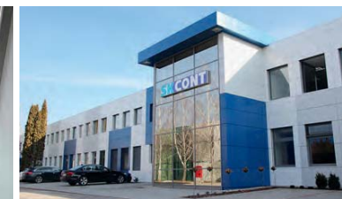
Factory in SK - Komarno