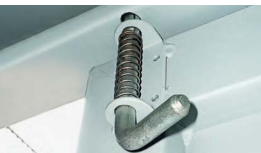
2 internal galvanised locking devices