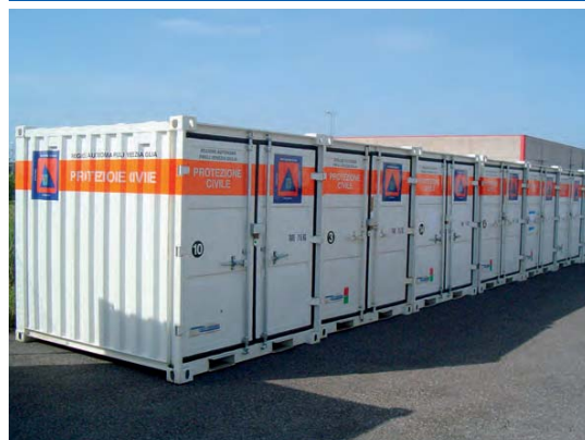
Storage containers used in disaster response