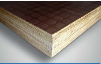
Bamboo flooring with non-slip coating