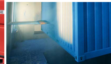
Paintwork using powder coating