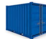
Type LC 10'