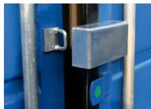
Burglary prevention device installed