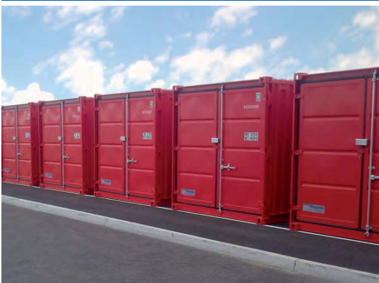
Material storage in operation