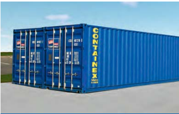
Shipping container 40'