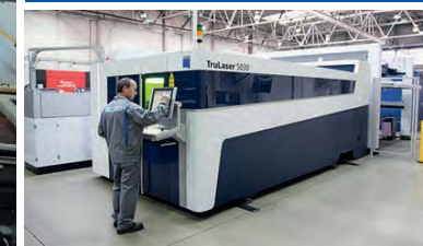
Laser cutter machine