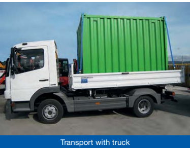
Transport with truck