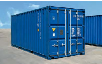
Shipping container 20'