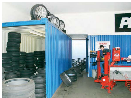
Tyre storage in the garage