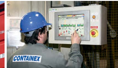
High degree of automation of the production