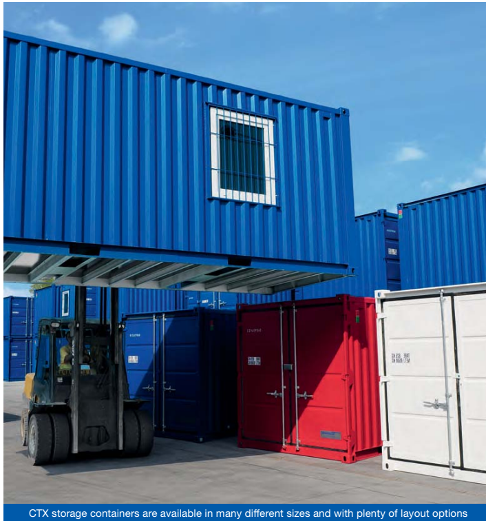
CTX storage containers are available in many different sizes and with plenty of layout options