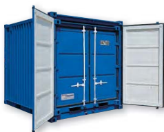
LC set example (LC 10' + 8')