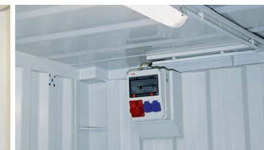
Light beams and distributor boxes with power outlets