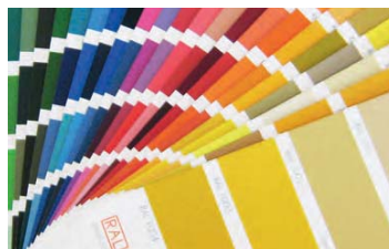
Different colours according to our CTX-RAL-chart