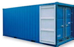
LC set example (LC 20' + LC 8' + LC 8')