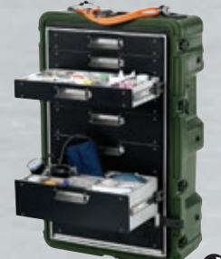
MEDCHEST 8 DRAWER