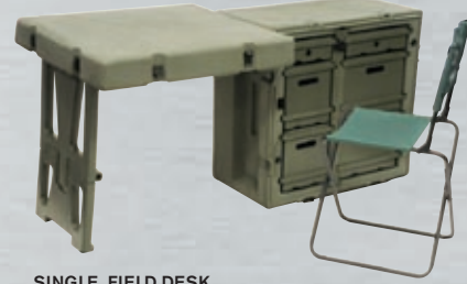
SINGLE FIELD DESK