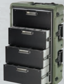
MEDCHEST 4 DRAWER