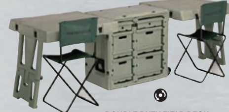
DOUBLE DUTY FIELD DESK