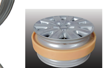
Rodgard APX Runflat systems are especially developed for TSS Heavy-Duty wheels.