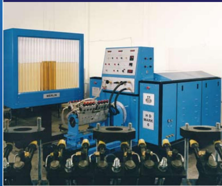
MERLIN MK6 WITH C418 & R418 18 CYLINDER MOBILE CALIBRATION RIGS

MERLIN DIESEL SYSTEMS LTD MANUFACTURE POSSIBLY THE LARGEST RANGE OF HEAVY DUTY DIESEL FUEL INJECTION TEST EQUIPMENT IN THE WORLD MERLIN DC, MK6 AND H123E SERIES ALL OFFER A SUITABLE SOLUTION FOR TESTING MANY OF THE MARINE, RAIL & POWER GENERATION PUMPS IN SERVICE AROUND THE WORLD TODAY