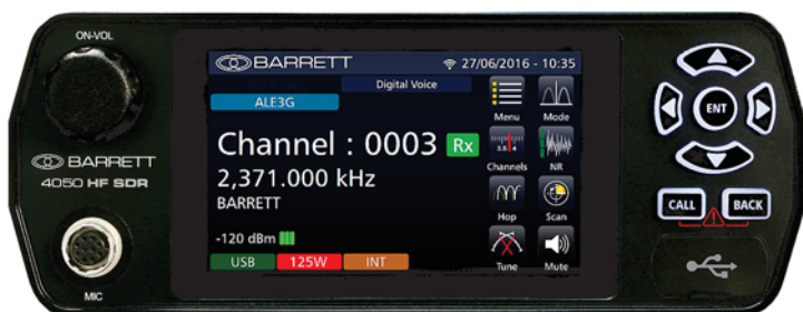
The Barrett 4075 amplifier natively supports the Barrett 4050 HF SDR Transceiver/Exciter

The Barrett ISO9001 Quality Assurance Program ensures consistent performance and the highest reliability.