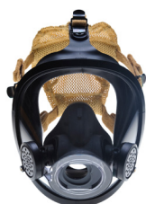
AV-3000 SureSeal Kevlar® Head Harness