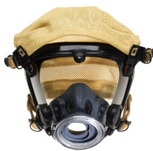
AV-2000 Kevlar Head Harness