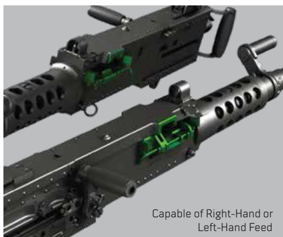
Capable of Right-Hand or Left-Hand Feed