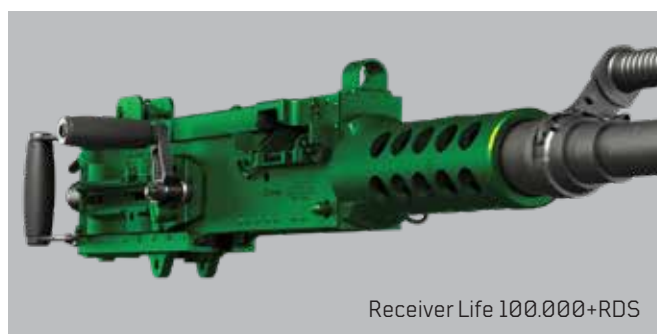
Receiver Life 100.000+RDS