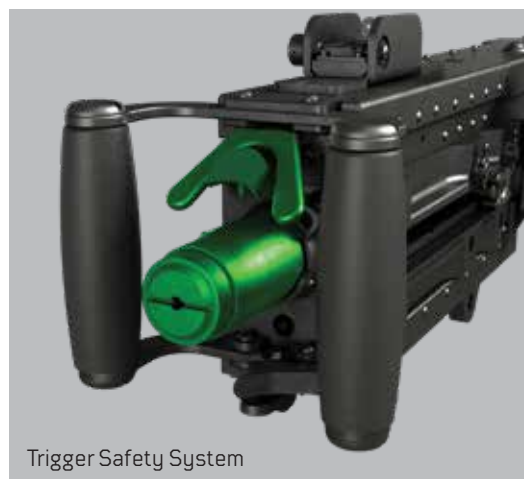
Trigger Safety System