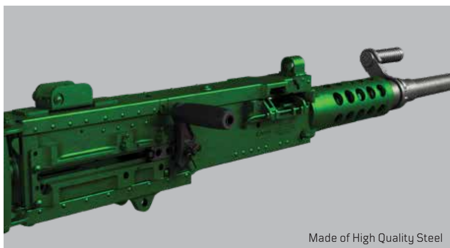
Made of High Quality Steel