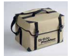
8 LITRES PAYLOAD