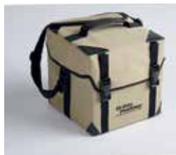
4 LITRES PAYLOAD