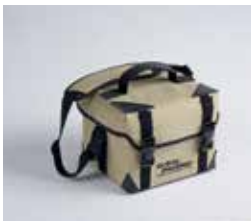
2 LITRES PAYLOAD