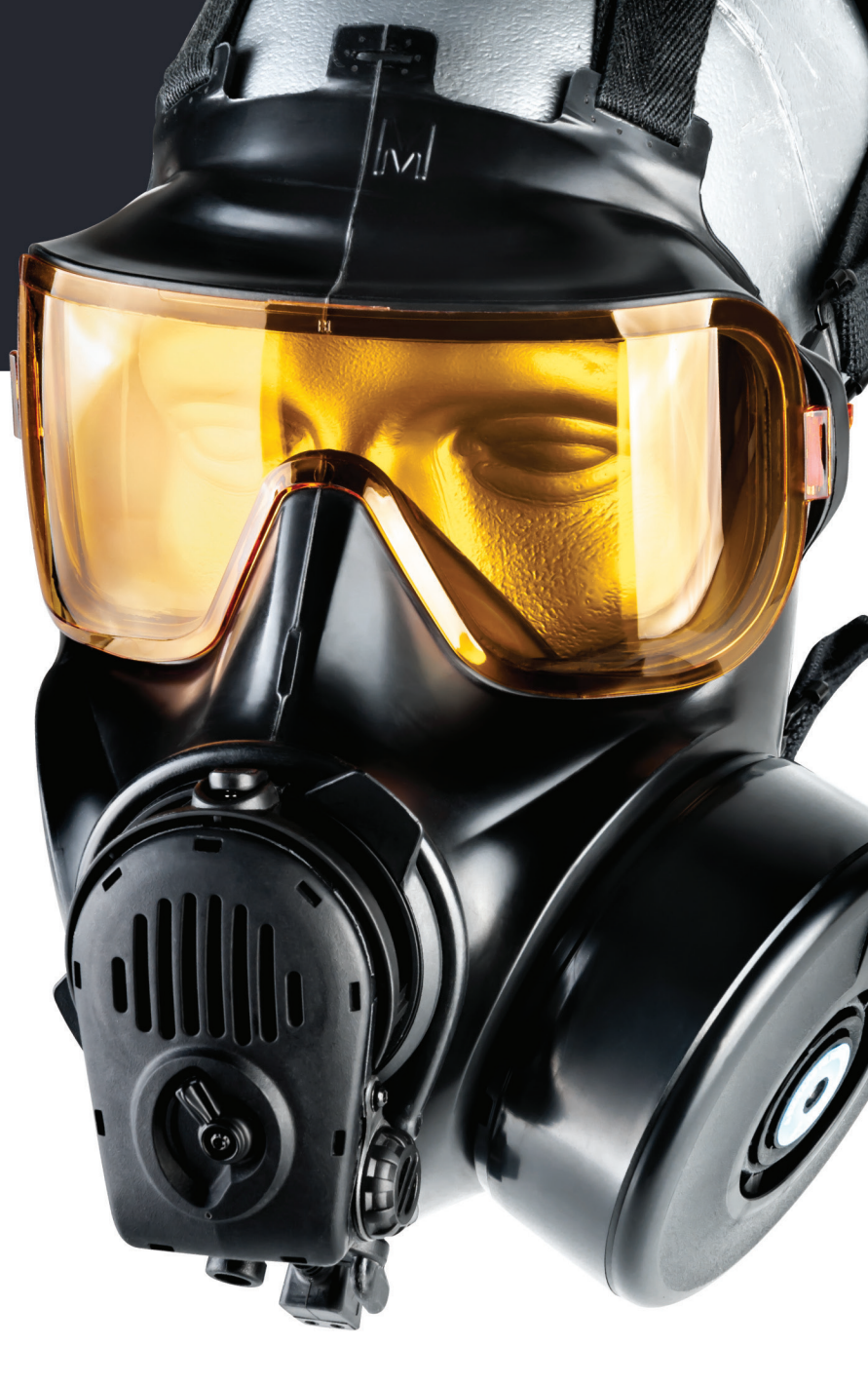
FM54 shown with optional Voice Projection System, Blueblocker Outsert and CTCF50 Canister.