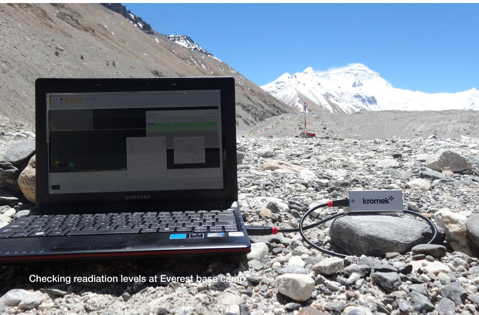
Checking radiation levels at Everest base camp

Gate Input: used to suppress pulse height output via the USB interface to K-Spect for anticoincidence. Energy and timing outputs are unaffected.