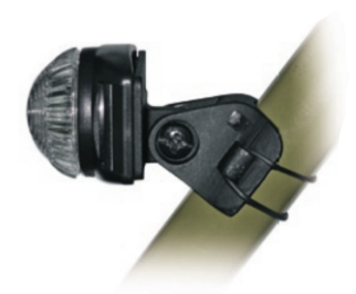
Bike Mount P/N: 49005

Stretch nylon strap that can be used to fasten the Guardian to the arm or wrist, or a multitude of other objects.