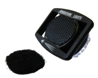
Helmet Attachment P/N: 49002

Clip-on attachment with a magnetic base that adheres to many metal surfaces.