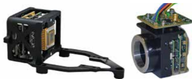
OEM options from board level camera to custom designs available in a range of sensors, interfaces and layouts