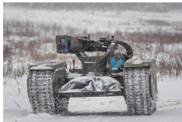
The R600S and the Milrem TheMIS

Like its lighter family members, the R600S is 'plug-and-play' compatible and is easily integrated with battle management systems.