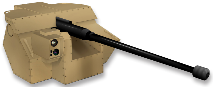
R800 with STANAG level II armour kit

The R800S offers protection options from STANAG level II through to IV providing tough, light, long range lethality to a broad range of vehicle classes.