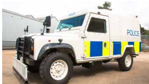
Designed, integrated and armoured composite Snatch Land Rovers for military and law enforcement operations.