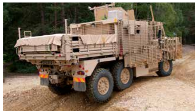
Engineering Technical Support Provider for the entire UK Protected Mobility Vehicle Fleet.