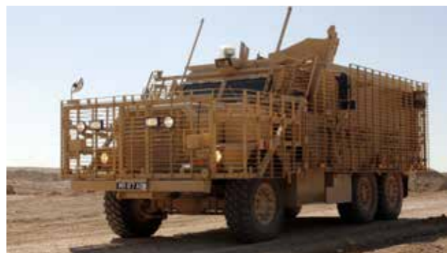
Integrated over 700 Cougar family vehicles and 30 platform variants, including the Mastiff, Ridgback, Wolfhound and Buffalo.