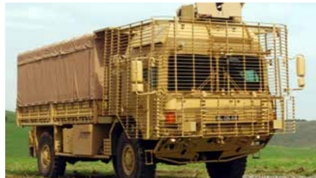
Designed, integrated and armoured over 380 MAN military trucks.