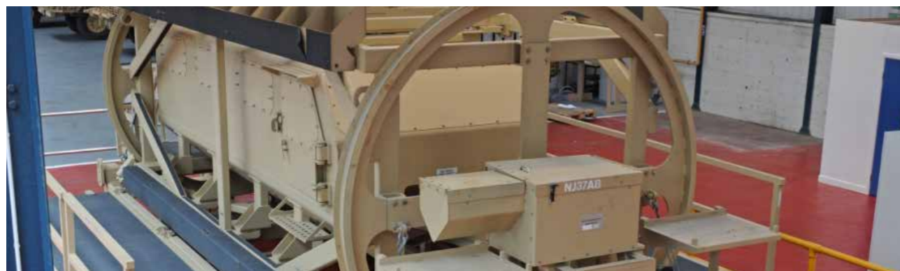
Engineering Authority for Roll Over training simulator used to train military staff prior to deployment.